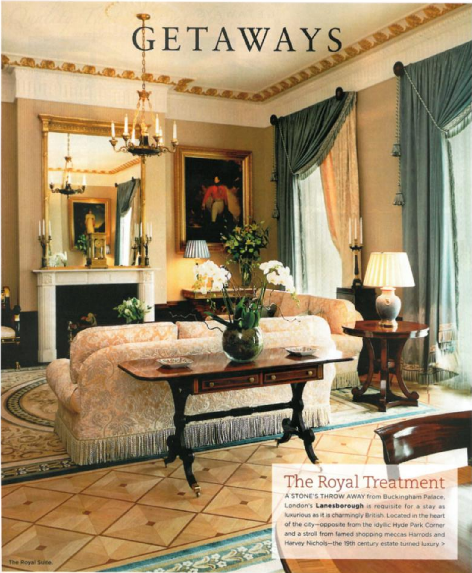
The Royal Suite.